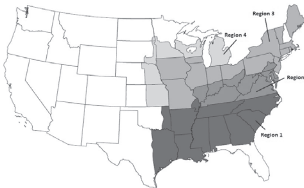
Regional Use Map

Region 1 (Maximum Rate 70 fl. oz. per Acre per Year): Includes the following states or portion of states where Forrest may be applied: Alabama, Arkansas, Georgia, Louisiana, Mississippi, Missouri (counties of Bellinger, Butler, Cape Girardeau, Dunklin, Madison, Mississippi, New Madrid, Pemiscot, Perry, Ripley, Scott, Stoddard and Wayne), North Carolina, Oklahoma (East of U.S. Highway 75 and East of Indian Nation Parkway), South Carolina, Tennessee, and Texas (includes area East of U.S. Highway 77 to State Road 239, including all of Calhoun County).